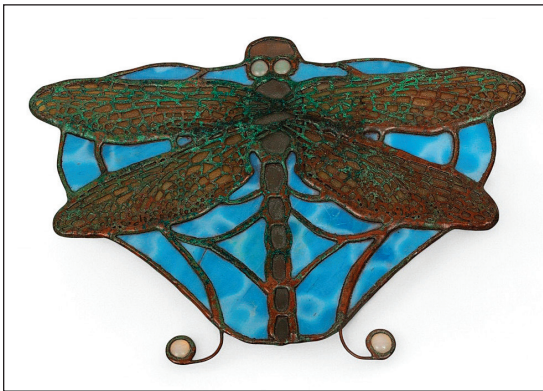
The highest price of the day two, $6,200, went to this bronze and leaded glass dragonfly attributed to Tiffany & Co., circa 1920 ($200/400).