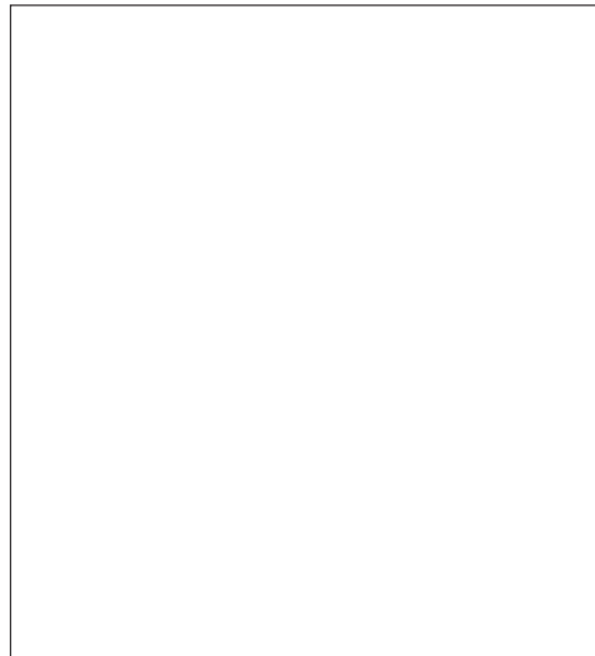
“Christ Giving Key of Heaven to St Peter” by the Circle of Domenichino, Italian, circa 1650, oil on paper, 18 by 16¾ inches framed, made $1,240 ($200/400).