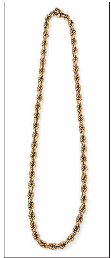
This 14K yellow gold spiral chain necklace, 18 inches long, sold to a local buyer for $1,054 ($300/500).

Review by Kiersten Busch, Assistant Editor