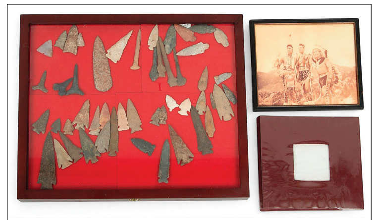
This 49-piece set of Native American stone notched and stemmed points, blades, drills and other artifacts was accompanied by a framed photograph and an album; the lot shot to $3,100 against a $150/300 estimate.